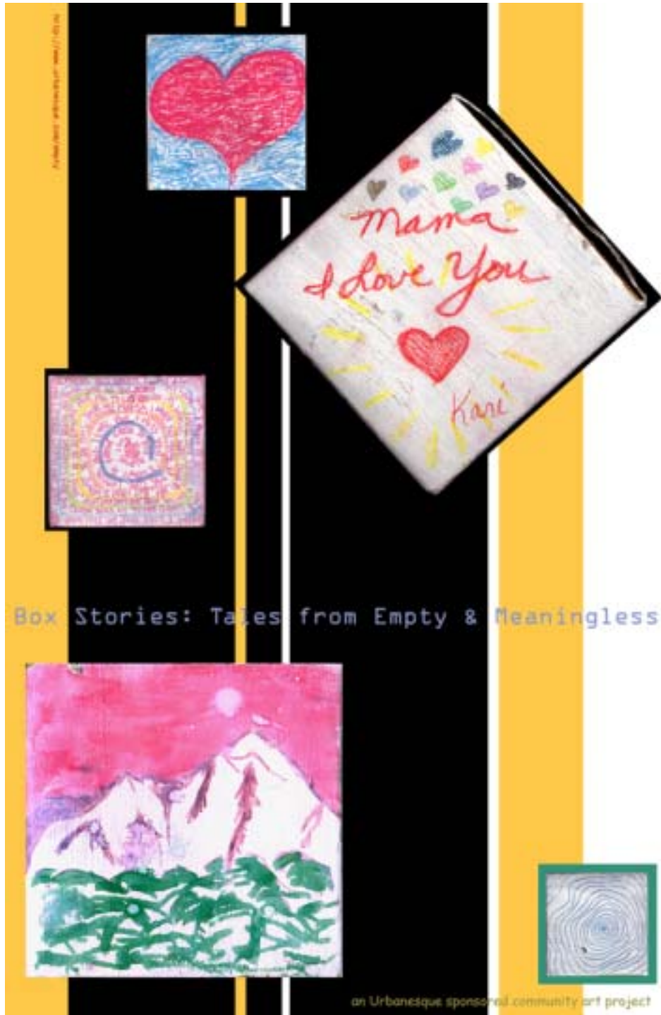
Box Stories: Tales from Empty & Meaningless

an Urbanesque sponsored community art project